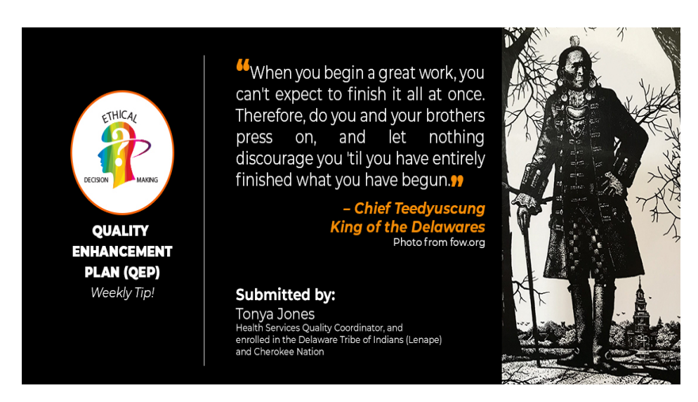
11/29 November https://nativeamericanheritagemonth.gov/ NAHM