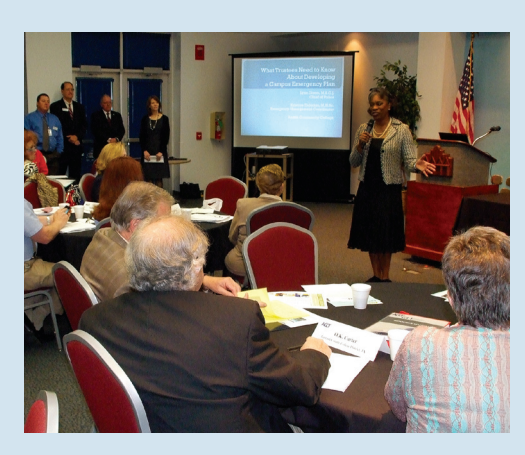
The association is a major voice of community college trustees to presidential administrations, U.S. Congress and federal departments of education and labor.

presidential administrations, U.S. Congress and federal departments of education and labor. The non-profit educational organization of governing boards represents more than 6,500 elected and appointed trustees who govern over 1,200 community, technical and junior colleges in the United States and beyond. The association educates community and technical college trustees through annual conferences focused on leadership development and advocacy, as well as through institutes and seminars.