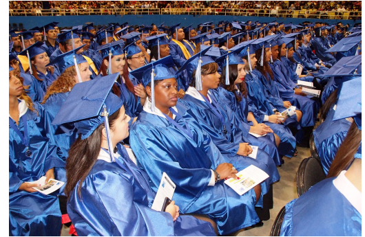
SPC graduates enjoy the commencement ceremony prior to receiving their degrees