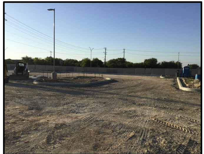
Laying asphalt next Tuesday on South Parking lot.