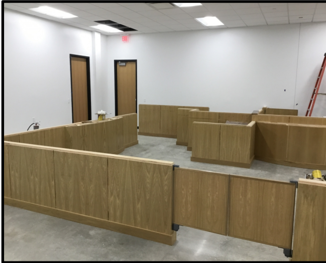
Stain and sealer installed on millwork in courtroom.