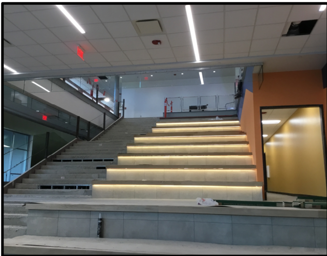
Learning stair lighting is installed.