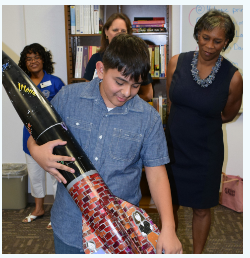
St. Philip's College faculty support in rocketry, manufacturing, environmental science among others.

Movement Enrichment (SLAM) program. Funding for SLAM was provided by Eastside Promise Neighborhood Out of School Summer Programming and U.S. Department of Education Strengthening Historically Black Colleges and Universities funding. Among the 60 recognized SLAM participants were 20 inventors ages 11-15 who completed nine weeks of learning both the practical, business, entrepreneurial and intellectual property elements of basic research using software from the U.S. Patent and Trademark Office in a number of science, technology, engineering and math disciplines studied during three weeks this summer at St. Philip's College and during five weeks at both the academy and the community center. The aspiring scientists were also freshly inspired from a field research visit to NASA in Houston. Before awards for their achievements were presented, the SLAM inventors competed hands-on in robotics and in a