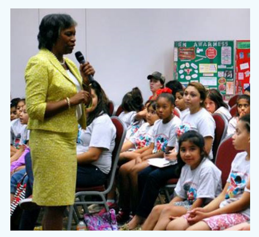
St. Philip's College hosted its second season of Jessica's Project.

unplanned pregnancy awareness events. The half-day of multidisciplinary learning was staffed by community agencies and the college's science degree candidates. The event engaged 100 visiting students from Girls Inc. of San Antonio as part of SPC's larger commitment to transforming socio-economic conditions for residents surrounding its main campus by improving education opportunities. Jessica's Project is a series of annual classroom events that have engaged hundreds of nutrition, chemistry, anatomy, physiology, biology and health sciences students with the community to address a health issue through an evidencebased program.