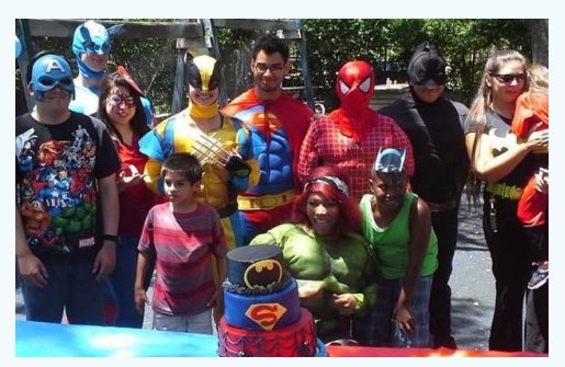
St. Philip's College student school supply drive and Super Hero Party.

On Aug. 16 at Davidson Respite House, St. Philip's College alumni and current degree candidates gave back by donning costumes in 108-degree heat to support a school supply drive and Super Hero Party for the young