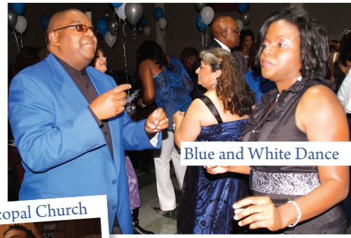
Blue and White Dance