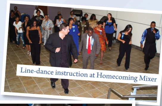
Line-dance instruction at Homecoming Mixer

Homecoming concluded on Sunday, October 24 with a service and reception at the founding church of the 112-year-old college, St. Philip's Episcopal Church.