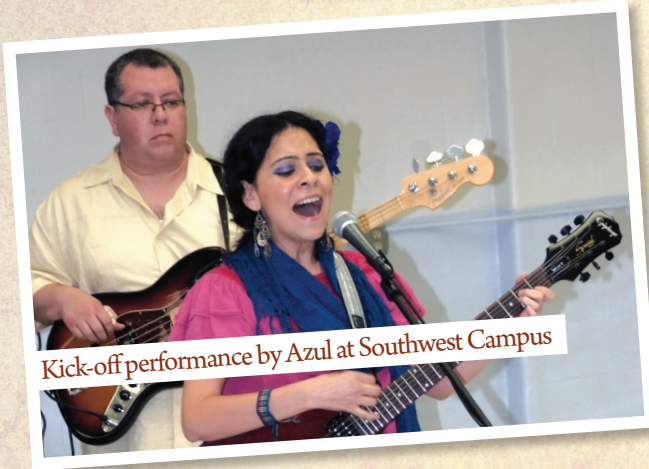
Kick-off performance by Azul at Southwest Campus