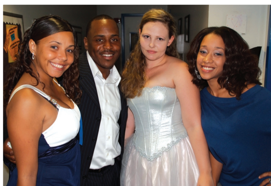
(Photo on left) Homecoming King and Queen candidates. (Photo on right) Azul performs at Southwest Campus.