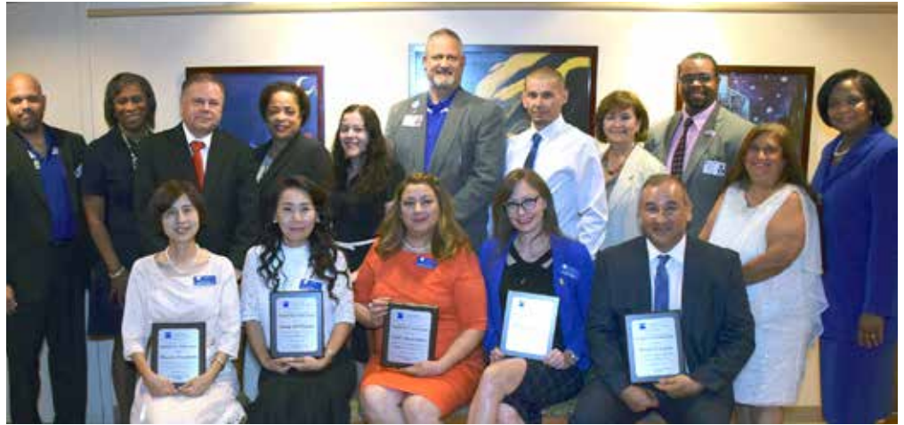
SPC Presidential Scholarship recipients (seated) joined college guests and administration members (standing) for the ceremonial announcement of the scholarship awards.

Six SPC degree candidates have been announced as recipients of the Dr. Adena Williams Loston St. Philip's College Presidential Scholarship for the 2016-2017 academic year. Presidential Scholarships are among student assistance and leadership programs funded through more than $1 million raised during the annual SPC Scholarship Golf Tournaments. The recipients for