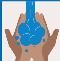
WASH YOUR HANDS BEFORE WEARING YOUR MASK

The Alamo Colleges District requires all students, staff and faculty to wear a face covering and mask while on campus to ensure the safest possible environment.