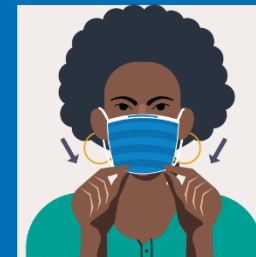
STRETCH THE MASK TO OVER YOUR CHIN