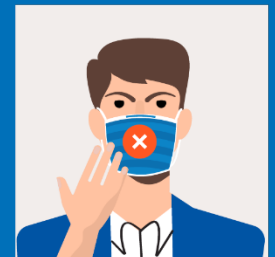
DO NOT TOUCH THE MASK WHILE USING IT