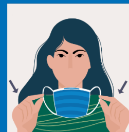
REMOVE THE MASK FROM BEHIND BY HOLDING THE STRINGS WITH YOUR HANDS