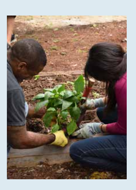
Gardeners (top and bottom images) learn and give back to the community.

On Oct. 9th in the East Side Community Garden, 150 nutrition students began the college's second season of sharing knowledge as guests in the garden. The project occurs with three to four student volunteers working independently most days of the week through the semester, but Oct. 9th was a day for all 150 currently enrolled nutrition course students to be present as volunteers. The students prepared soil, planted, pruned, and worked with mulch in the 6,500 squarefoot garden where seniors can take their gardened produce home for meals.