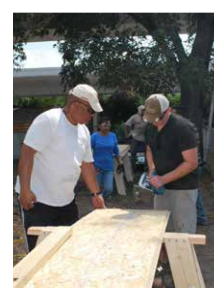
Construction technology students (top and bottom images) use skills to repair the home of an elderly couple.