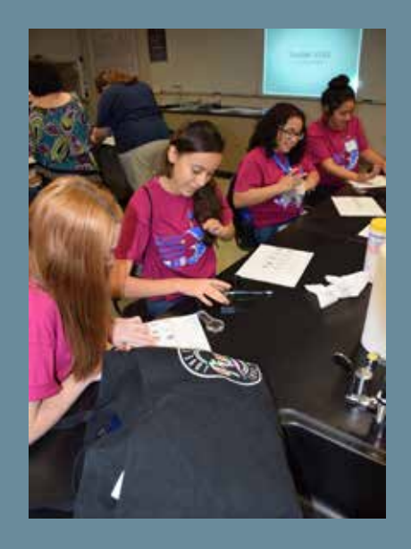
Students attend workshops led by professional women in the science, technology, engineering and math (STEM) fields.

SPC promoted future economic security for 150 local girls in grades 8–12 in the college's 2015 Women Breaking Through Conference on Oct. 10th hosted by the Center of Excellence for Mathematics. Conference highlights included workshops led by professional women in the science, technology, engineering and math (STEM) fields. Designed by current professional women to instill confidence in potential professional women, the workshops allowed teenaged girls to explore technology, chemistry, nanotechnology, applied mathematics, molecular biology, and science.