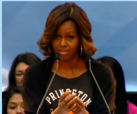
First Lady addresses 60 prospective St. Philip's College students.

On May 9, St. Philip's College was nationally recognized for its commitment to innovative solar energy education. The college's nationally-noted alternative energy and power generation program earned mention in a May 9 White House Fact Sheet supporting President Obama's initiatives to continue rapid growth of the U.S. solar energy capability that is both saving Americans money and creating U.S. jobs.