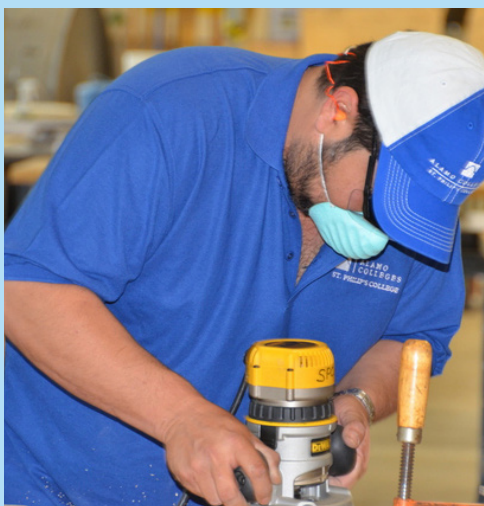
A student preps children's furniture for branding.