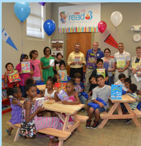
Children like the finished product as they read and learn.

When construction technology faculty members at the college learned that the San Antonio Housing Authority (SAHA) was creating innovative environments for elementary-age