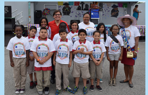
Bowden Elementary School made its first CultureFest visit.

on their first CultureFest visit. The Bowden students were invited to the family-oriented event to promote neighborhood college culture and as an immediate reward for the children having successfully completed their STAR tests (below). While the Chili's franchise location at The Quarry competed as a first-time challenger in the annual rib cooking competition on Rib Row, culinary arts degree candidates prepared and served each entry to rib contest judges. As welding degree candidates hand-built two college-branded grills for the Scholarship Fundraising Auction of classic South Texas outdoor cooking essentials on Rib Row, eight construction degree candidates built one college-branded youth size picnic table and one college-branded bookcase, and all of those students honed professional skills during the technical project. New for 2014, the college's traditions of learning and giving back continued as early childhood education students provided leadership in the Rib Row Kid's Corner for pre-school and elementary school CultureFest guests. Thirteen massage therapy students staffed the unique Rib Row 500-Hour Massage Therapy Zone to ensure event guests were refreshed and ready for their next Fiesta event. Thirty vocational nursing students staffed the first aid tent at Rib Row, and 20 automotive technology students were essential by assisting with the Rib Row Car Show logistics with marketing,