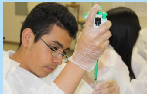
Affordable summer camp lineup included biotech and biofuels.