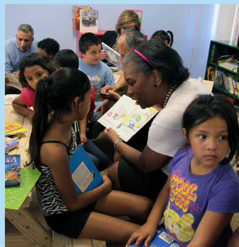
Students and college leadership help city put child literacy first.