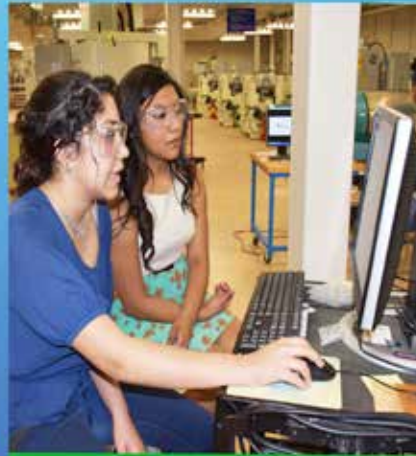
ELECTRICAL & MECHANICAL TECHNOLOGY