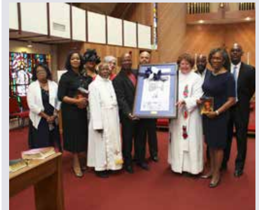
College and church leaders observing the church's 121st anniversary with a ceremony May 1.