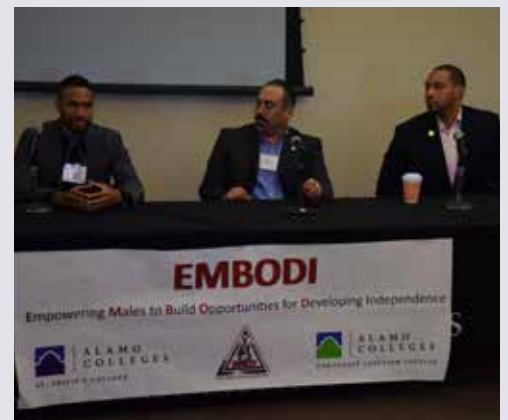
Panelists at the 2016 Empowering Males to Build Opportunities for Developing Independence conference included The Honorable Tommy Calvert, Bexar County Commissioner for Precinct 4.

On May 7 in the Sutton Learning Center, SPC hosted the 2016 Empowering Males to Build Opportunities for Developing Independence conference for male middle school, high school and college students. Panelists included The Honorable Tommy Calvert, Bexar County Commissioner for Precinct 4, both the youngest and first African-American county commissioner in more than 170 years of Bexar County history. Three $500 scholarships were awarded to SPC student essayists. The day included two age-specific concurrent workshop sessions for the event themed You Are Unstoppable.