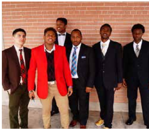
Sam Houston High School students (images above and below) suit up to participate in a March 8 presentation on goal-setting, academic and career opportunities at SPC.

On March 8, SPC hosted 30 members of the Suit Up: Business and Professional Clothing Exchange Program. Suit Up is a community initiative to collect new or gently worn professional attire for teens and adults entering or re-entering the workforce. Thirty Sam Houston High School students participated in a presentation on goal-setting, academic and career opportunities at SPC. Following the presentation, guests visited the Bowden Alumni Center to learn about SPC history.