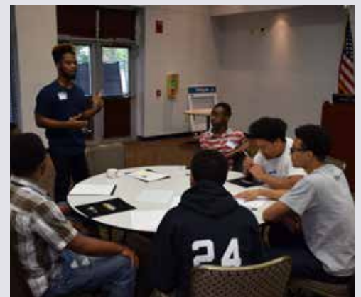
The 2016 Empowering Males to Build Opportunities for Developing Independence conference for male middle school, high school and college students included age-specific concurrent workshop sessions.