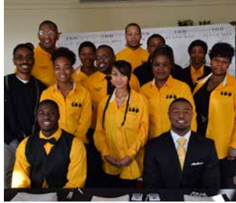
SPC Collegiate 100 members supporting the Feb. 27 100 Black Men, Inc. Economic Empowerment Summit as event partners.

On Feb. 27 at the Watson Fine Arts Center, SPC participated an educational partner in the 2016 100 Black Men, Inc. Economic Empowerment Summit. The summit featured sessions in education, financial literacy, STEM careers and workforce development for 100 guests ages 18-24.