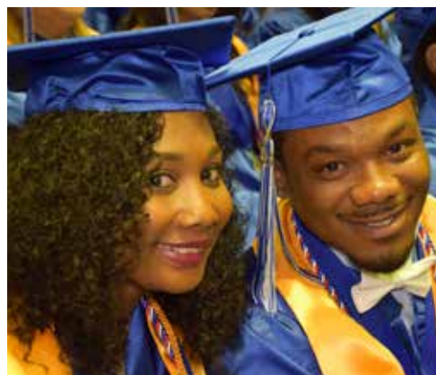
SPC students graduated in record numbers May 13.