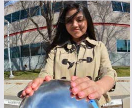
A 2016 Texas Alliance for Minorities in Engineering San Antonio Divisional STEM Competition participant during the 2016 Green Energy and Engineering Conference Feb. 26.

On Feb. 26 at the Southwest Campus, SPC's 2016 Green Energy and Engineering Conference for aspiring and practicing members of the area's math, science, technology and engineering community during National Engineering Week. The conference's 340 guests participated in hands-on workshops in science; concurrently the 2016 Texas Alliance for Minorities in Engineering San Antonio Divisional STEM Competition had more than 100 participants.