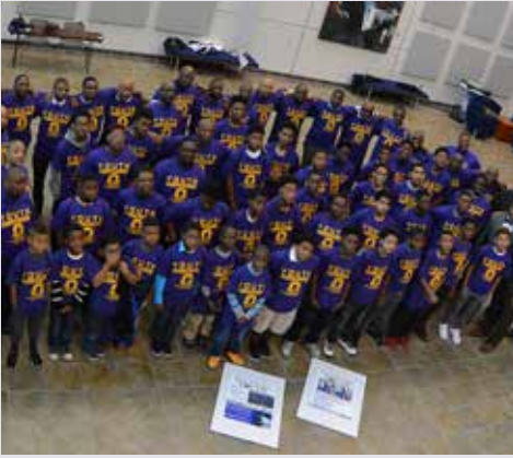
Omega Psi Phi Youth Leadership Conference attendees above gathering in the SPC Center for Health Professions during the Feb. 27 conference.

SPC participated as an educational partner in the Omega Psi Phi Youth Leadership Conference on Feb. 27 at the Watson Fine Arts Center. The conference featured four grade-appropriate workshop sessions for 180 students grades 4-12 and the presentation of two $250 awards to two prospective SPC students. SPC also gave back in this partnership by providing employees to host the event and conduct one of the workshop sessions for the event themed Manhood, Scholarship, Perseverance.