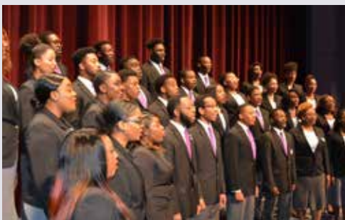
The 65-member A Cappella Choir of Wiley College performing for 600 guests at SPC on March 5.