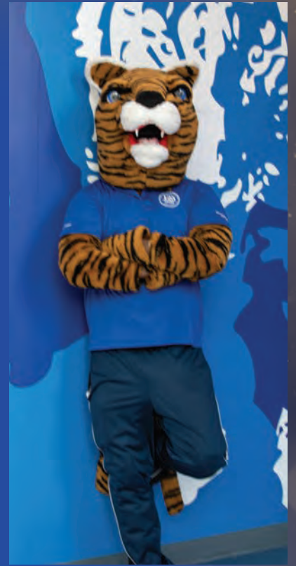
Phil the Mascot