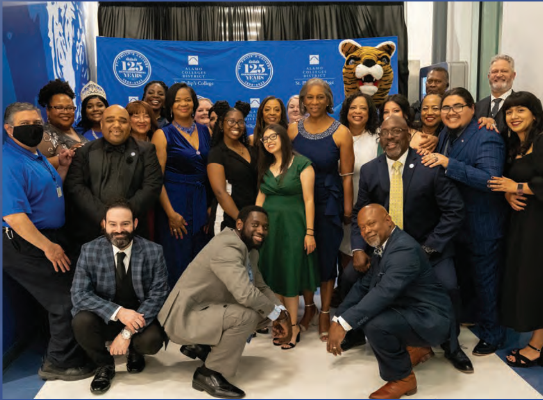
St. Philip's College students, staff and faculty assembled for a group photo after the conclusion of the 125th celebration.