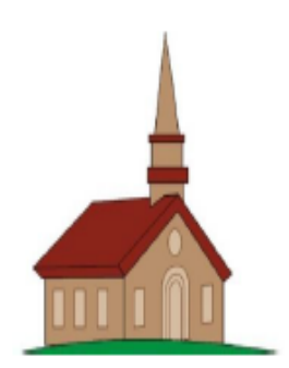
Places of worship, such as churches, synagogues, mosques, and temples.