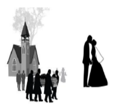
Religious or civil ceremonies or observances, such as funerals and weddings.