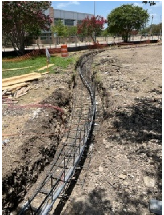
Digging a trench for the proposed low landscape wall. The trench prepared with rebar to pour concrete for its base.