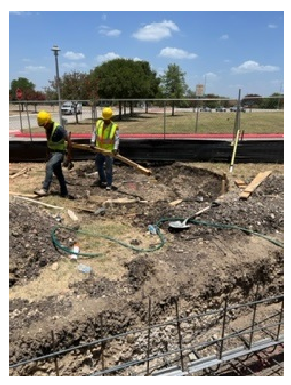
Workers preparing one of the sites for a proposed concrete pad. 6" of flex base and rebar will be installed for the upcoming pour. Concrete depth will be of 5".