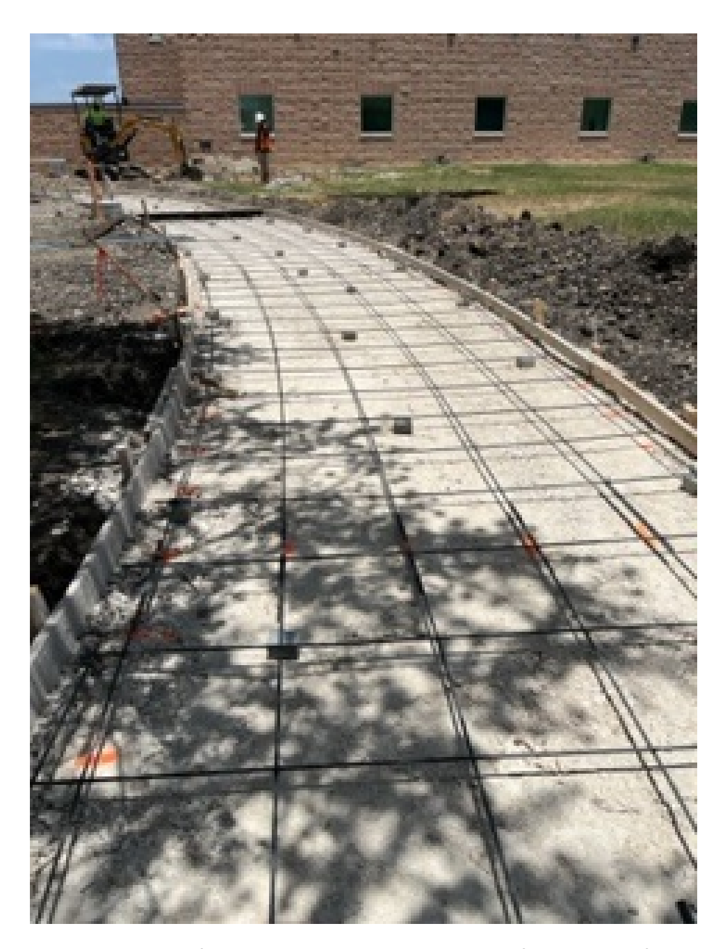
East sidewalk with flex base and rebar. Pouring concrete for a portion of it.