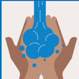
WASH YOUR HANDS BEFORE WEARING YOUR MASK

The Alamo Colleges District requires all students, staff and faculty to wear a face covering and mask while on campus to ensure the safest possible environment.