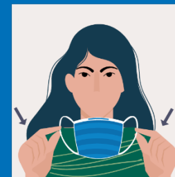
REMOVE THE MASK FROM BEHIND BY HOLDING THE STRINGS WITH YOUR HANDS