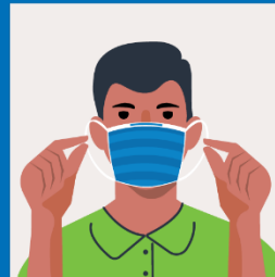
SECURE THE STRINGS AROUND YOUR EARS