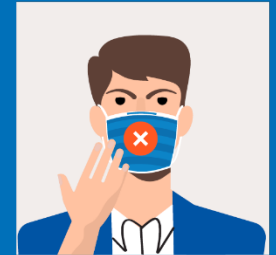
DO NOT TOUCH THE MASK WHILE USING IT