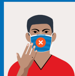
DO NOT TOUCH THE MASK WHILE USING IT