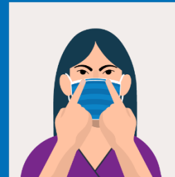
FIX THE MASK TO FIT THE SHAPE OF YOUR NOSE