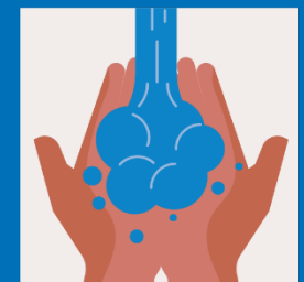
WASH YOUR HANDS AFTER REMOVING YOUR MASK