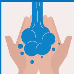
WASH YOUR HANDS BEFORE REMOVING YOUR MASK