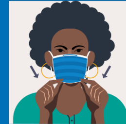
STRETCH THE MASK TO OVER YOUR CHIN