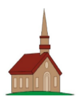
Places of worship, such as churches, synagogues, mosques, and temples.

Medical treatment and health care facilities, such as hospitals, doctors' offices, accredited health clinics, and emergent or urgent care facilities.