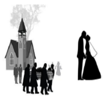
Religious or civil ceremonies or observances, such as funerals and weddings.