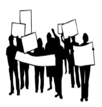
During public demonstrations, such as a march, rally, or parade.