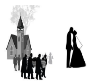
Religious or civil ceremonies or observances, such as funerals and weddings.