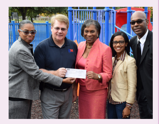
SPC leadership had a ceremonial ribbon cutting on April 21 for a $13,744 upgrade of the mulch surface under the Center's outdoor playground equipment to a permanent pour-in-place fall protection surface.

The U.S. Division of Mexico's Grupo Bimbo, one of the world's largest baking companies, funded the upgrade work. Thank you, Bimbo Bakery for being a good neighbor!