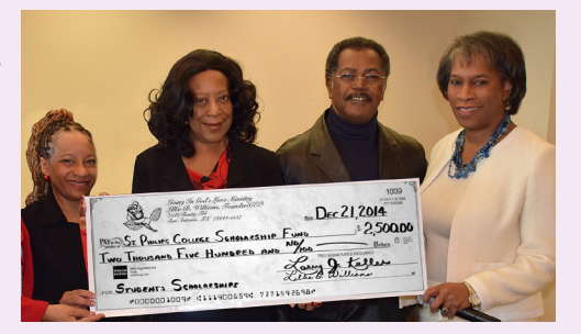
Living in God's Love present a big check at the President's Reception.