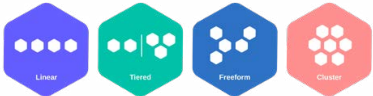
Image replicated from Learning pathways and badge system designs , December 12, 2022.

The structure of digital badge pathways may take many forms. Badges can be grouped or connected in different ways within the badging platform. For example, badge pathways can be linear, tiered, freeform, or clustered. Digital badge pathways often culminate with an end-of-pathway digital badge.