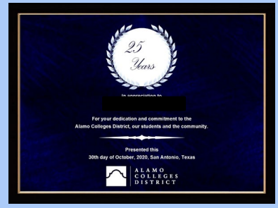
25-years of Service