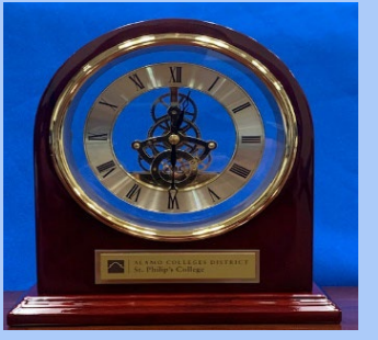
35-years of Service