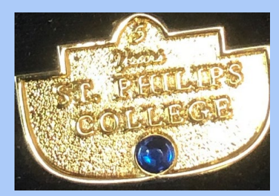
5-years of Service