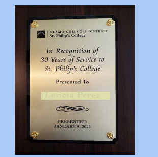
30-years of Service